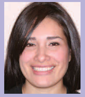
Before Cosmetic Dentistry