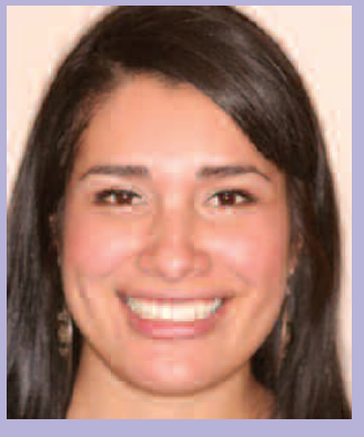
After Cosmetic Dentistry